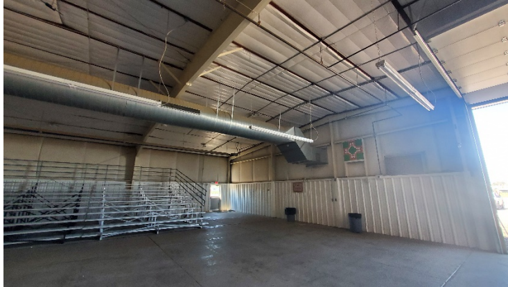
Overview of power source